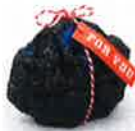
2001 Christmas Presents

Santa and the elves didn't know what to do with all those presents already premade, for the kids who were on the nice list but now on the naughty list sama asked a mechanic elf to see if the list maker was broken. "Sorry sir but it is broken there's just a lot of kids on the naughty list" said baby the mechanic elf, all the elves had to do is wrap presents but with coal inside them.