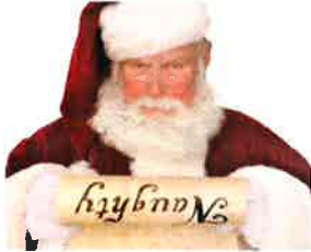
Santa Looking At Christmas List

December first was a catastrophe, this morning when Santa went to get his list to give to the working elves he screamed his head off! Over 1 simple night more than half of the kids of the world had gone to the naughty list.