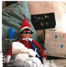
Elves got food poisoning! Will they infect Santa?!

No elves. No Toys. Yesterday, Santa's workshop had a terrifying knock out. Candy Cane hospital is filling up! poisoned cookies and gingerbread! Reindeer cops suspect the grinch is up to no good once more, is this the case?